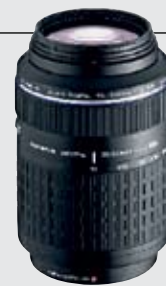
■ LENS 3: 70-300mm

It was great to have a good excuse to turn my camera on Scarborough, and there was plenty of subject matter to work with.