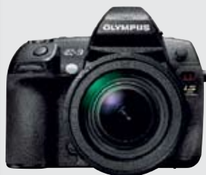
■ CAMERA: Olympus E-3