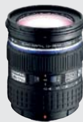
■ LENS 1: 12-60mm