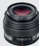
■ LENS 2: 50mm Macro