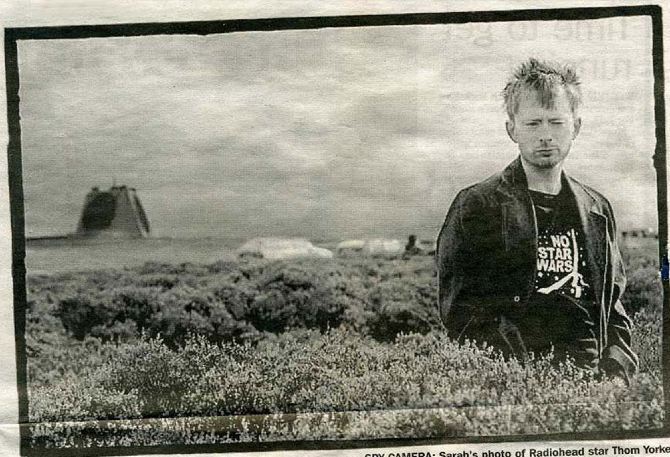
SPY CAMERA: Sarah's photo of Radiohead star Thom Yorke protesting at the radar base at RAF Fylingdales